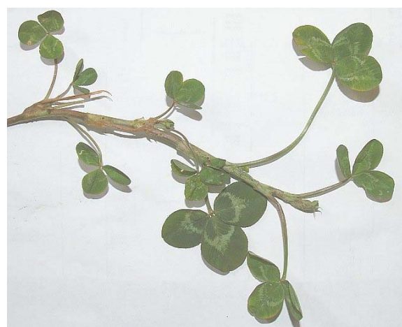
Figure 3. The characteristic stolon structure and leaf markings of Trophy white clover

Trophy is moderately high in hydrogen cyanide (HCN), which potentially confers pest tolerance without limiting livestock performance. The level is comparable with contemporary New Zealand cultivars such as Prestige.