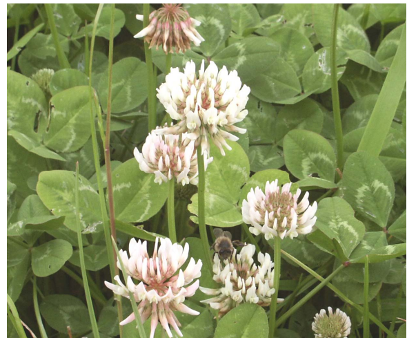
Figure 1. Trophy – a white clover cultivar locally adapted to cope with summer moisture stress